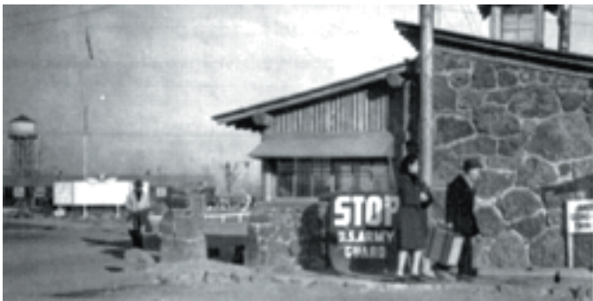
Entrance to Hunt Camp, 1943

It's hard to explain the spiritual feeling one gets standing on the actual site where thousands of people were imprisoned. The hope is that many of you, internees, friends and families of internees will take the opportunity to participate in future pilgrimages. The interactions among former internees and those too young to have been imprisoned helps all of us to understand our roots ourselves and is both healing and exhilarating.