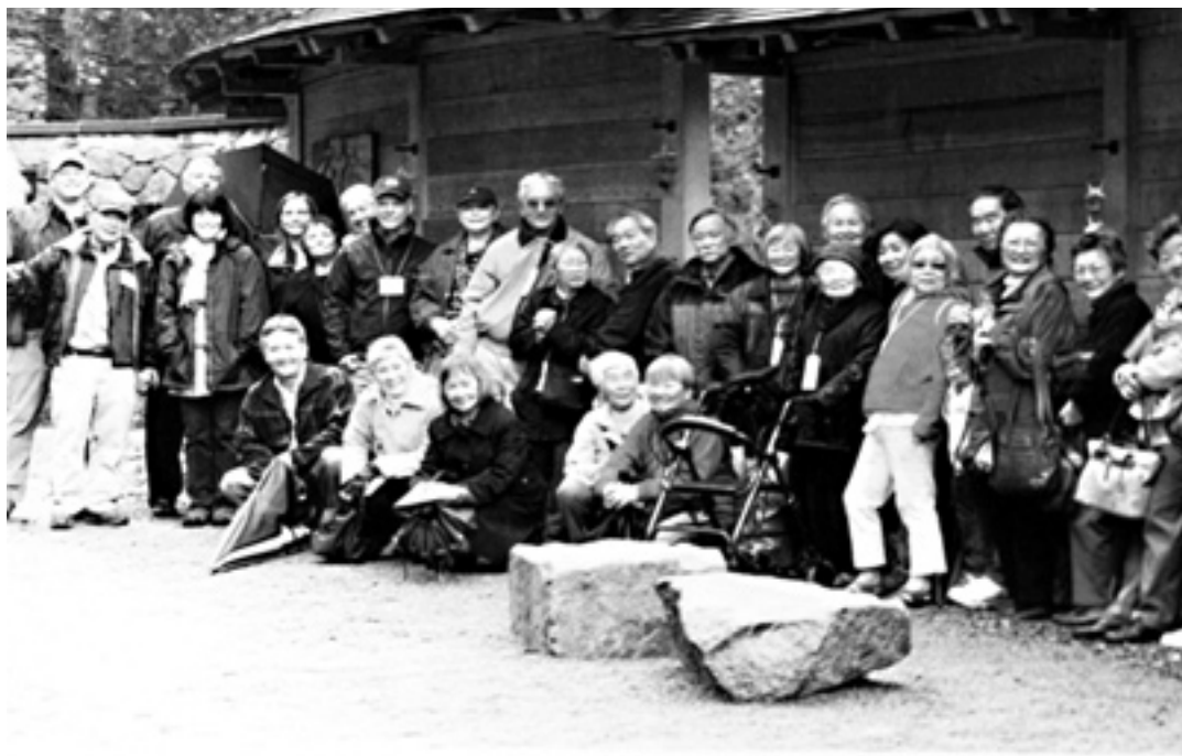
A wet but happy group in May at the Memorial Wall hosting several dozen Seattle 8th graders. The group included 17 actual survivors honored and remembered on the wall.

Despite winter-like winds and rain on March 30th, more than 700 people turned out to mark the 70th Anniversary of the first of 120,000 Japanese Americans to be forcibly exiled from the west coast during World War II.