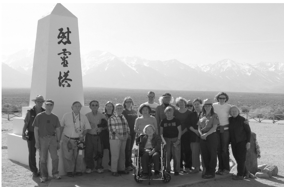
The 2011 pilgrimage to Manzanar in front of the “Soul Consoling Tower.”